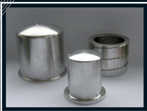
Figure 1 – Steel Industry